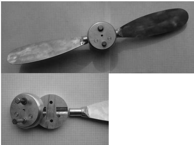
Flat Bladed Propeller...Adjustable Blade Angle Clamping Hub

The mathematic model allowed us to quickly change the initial variables and see the impact they would have on the outcome. This allowed us to tinker with the numbers and once final dimensions were agreed on, we sent the numbers back to Rolls Royce where Jake Piskura created a 3D CAD image of the propeller. This CAD file was sent to the LBI Inc. where they used a 5-axis saw to cut the propeller out of a solid piece of material. The propeller was sent back to the high school where we attached it to the submarine.